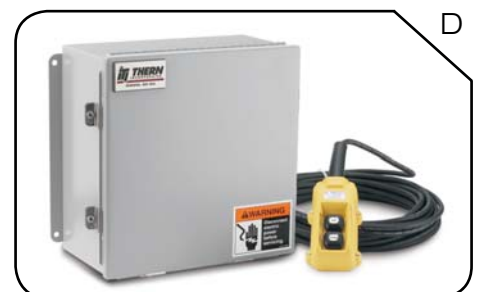
Standard control option.