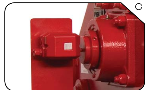
Shown with RLS option.