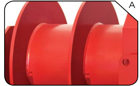
Shown with double compartment drum modification.

MANUAL OVERRIDES for winch operation in power loss situations.