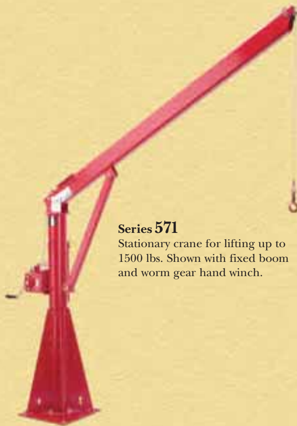
Series 571 Stationary crane for lifting up to 1500 lbs. Shown with fixed boom and worm gear hand winch.

Custom Cranes with modified reaches or heights, special finishes, AC, DC, air or hydraulic powered winches.