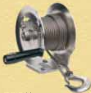
RW50 Ratcheted stainless steel storage spool for wind up of unloaded wire rope.