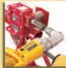
Worm Gear Hand Winches Drill drivable. Includes internal mechanical brake.