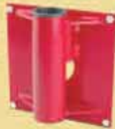
Wall Mount Bases Mount on vertical surfaces.