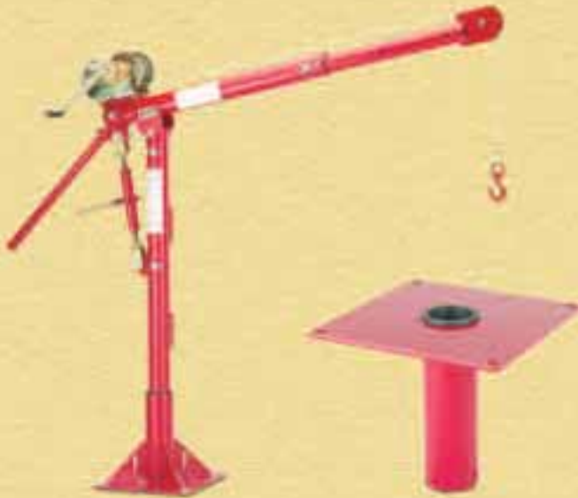
Pedestal Style Bases Mount upright on top of a horizontal surface.

Multiple base options are available for each of our portable cranes. Independent bases are sold separately and are available in all finishes. Pedestal, wall, socket style, and roll bases allow operators to easily move cranes from one base to the next. Crane bases can also be installed in truck beds for maintenance applications.