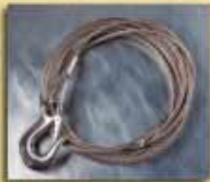
Wire Rope Assemblies In galvanized or stainless steel, with different length and hook configurations for use with Thern winches and cranes.