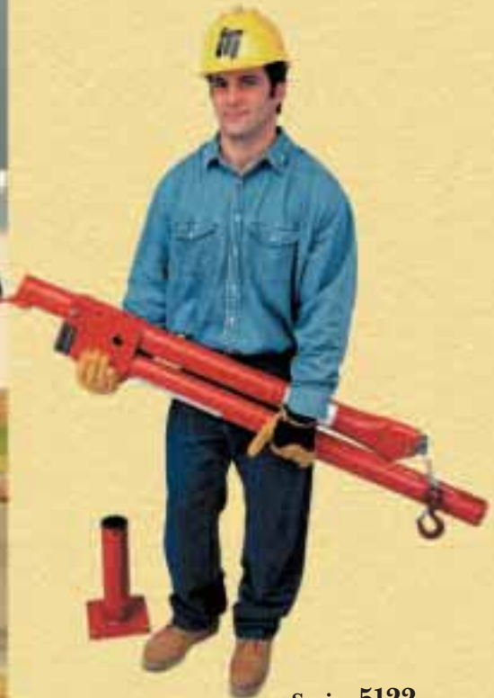
Series 5122 portable crane, shown in powder coat finish, folded for transport.

Crane bases installed in truck beds provide added portability for maintenance applications.