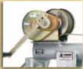
Zinc and Iridescent Dichromate Plated Spur gear hand winches for lifting. Includes brake.

Large Diameter Drums minimize wear to wire rope assemblies and help extend their life.