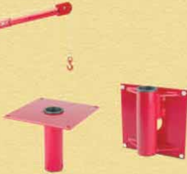
Socket Style Bases Mounted flush with a horizontal surface.