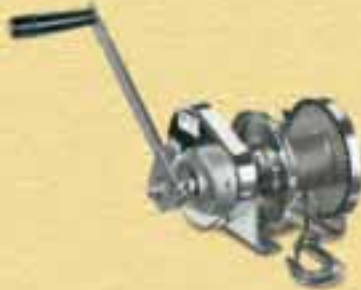
Stainless Steel Spur gear hand winches for lifting. Includes brake.