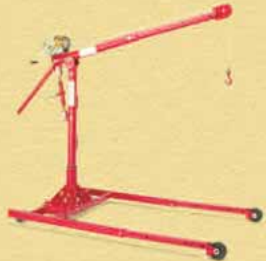
Roll Bases Allow our davit cranes to operate as portable floor cranes. Base legs adjust in length and width.