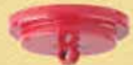
Base Covers Plastic base cover fits over the hole in crane bases to prevent water from collecting inside when crane is not in use.