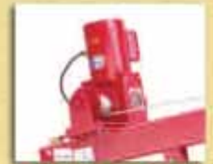
Electric Worm Gear Power Winches Includes internal mechanical brake. AC, DC, air and hydraulic power options available.