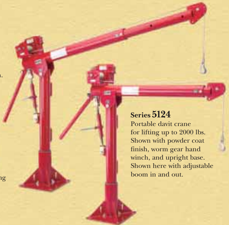
Series 5124 Portable davit crane for lifting up to 2000 lbs. Shown with powder coat finish, worm gear hand winch, and upright base. Shown here with adjustable boom in and out.