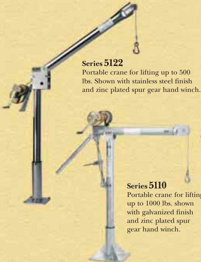
Series 5122 Portable crane for lifting up to 500 lbs. Shown with stainless steel finish and zinc plated spur gear hand winch.

Custom Cranes with modified reaches or heights, special finishes, AC, DC, air or hydraulic powered winches.