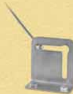
Cable Keeper Wire rope keeper attaches to base or other structure to hold free end of the wire rope when detached from crane.