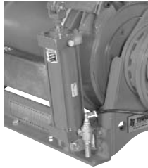
Automatic Band Brake