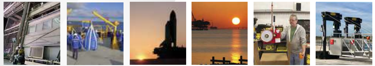
Optimus Steel 4ocean NASA BP Rinker S.A.F.E.

These products are not for lifting people or things over people.