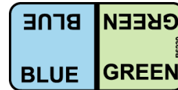
(B6230) 5PT10/20 load range indicator